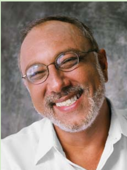
Photo and Cover Design—Doug Morton © 2006 Asia Pacific Media Services